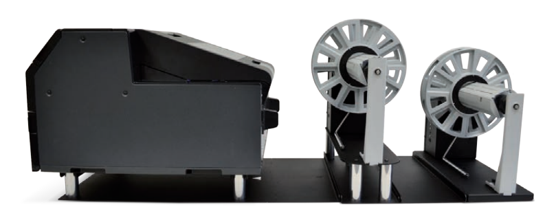
Epson C6500P printer - LABEL UNWINDER (UW6500P) - LABEL REWINDER (RW6500P) (Not included)

(250mm). Both Unwinder and Rewinder are equipped with a fixed 3" core holder. An external power supply 100/240VAC - 2.5A === at 24V allows an electronic circuit to provide, through the tension arm,