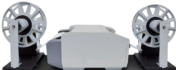
LABEL UNWINDER - Epson C831 Printer - LABEL REWINDER (Not included)