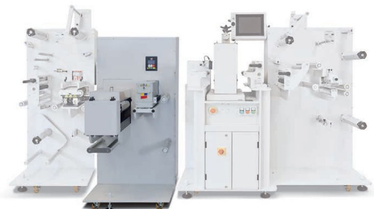
UV Varnish module inline with Aries