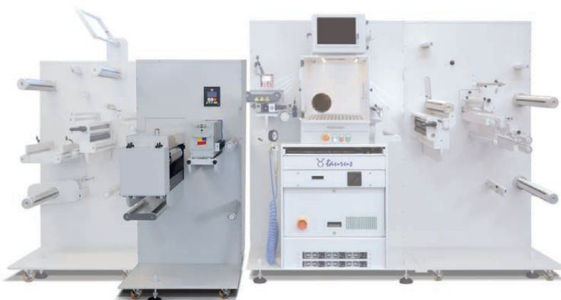
UV Varnish module inline with Taurus

Easy to use, it allows an alternative media protection to the classic cold lamination to offer a superior finishing level.